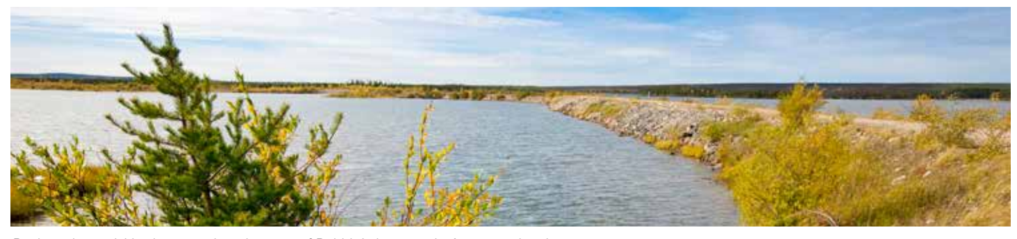
Reclamation activities have continued as part of Rabbit Lake operation's care and maintenance program.