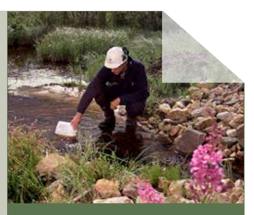
Rabbit Lake's environment department continues to collect and lab test downstream water and sediment samples.

During this care and maintenance state, Cameco has maintained open communications with our northern partners through community engagement.