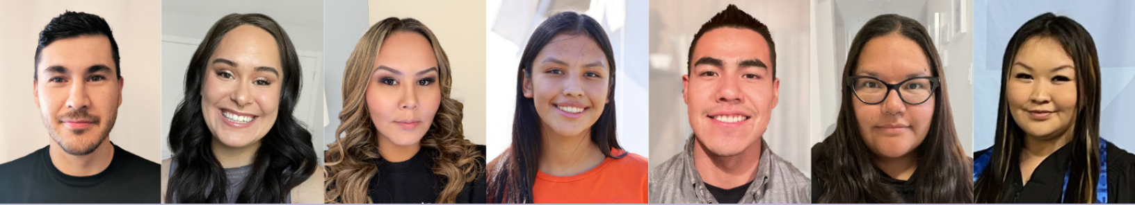
Some of the 2023 scholarship recipients, representing Île-à-la-Croix Buffalo Narrows, Black Lake, English River First Nation, La Ronge, Cumberland House, Wollaston Lake