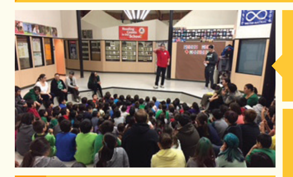
The Red Cross trains several Saskatchewan Roughriders each year to deliver anti-bullying and healthy relationship presentations to youth throughout the province.

"HEALTHY RELATIONSHIPS WILL HELP YOU GET OUT OF A BAD DAY OR TOUGH TIMES."