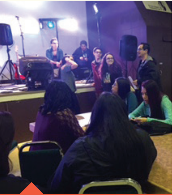
On November 25, 82 students arrived in Prince Albert for three days of workshops in the areas of stage presence, song-writing, singing, audio production and much more.