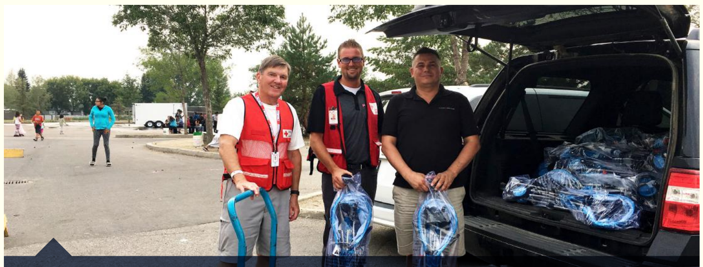
Red Cross and Cameco employees delivered baby strollers to young families from northeastern Saskatchewan while they were evacuated to Prince Albert and Saskatoon during the wildfires earlier this fall.